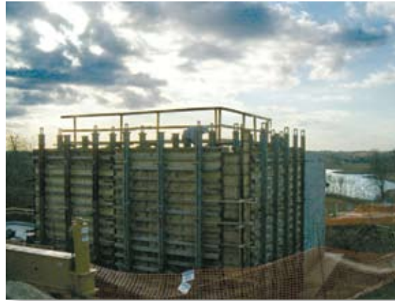
Design/build by BCI for pre-treatment plant additions for Nestle Prepared Foods.