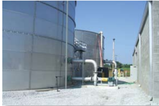
Design/build for General Mills by BCI to treat process water for non potable reuse.