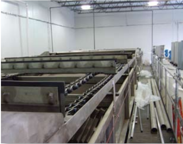
DAF for Koch Foods