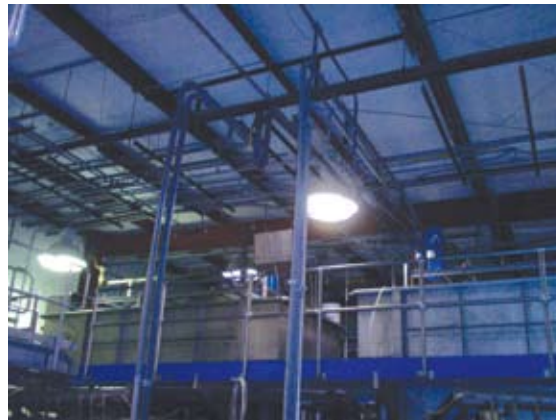
Wastewater pre-treatment improvements for Koch Foods completed by BCI.

“BCI exercises the best follow-up procedures to ensure quality. They are constantly communicating with everyone on the project to make sure things are going properly. While finishing on time and under budget, they still seem able to handle any challenges that come up. Their experience in the field definitely shows.”