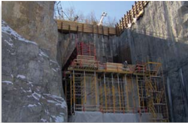
New Gyratory Rock Crusher at the Three Rivers Quarry in Smithland, Kentucky for Martin Marietta

“BCI is a very organized and well-managed company. This is evident in their men working in the field and in the planning of their field leadership. The timing of our first project with BCI was critical in order to meet a defined start-up date. Martin Marietta’s engineers and operations people were kept well-informed on both the construction activity and the process in which it was to be completed. Ultimately, we were able to meet that start-up date.”